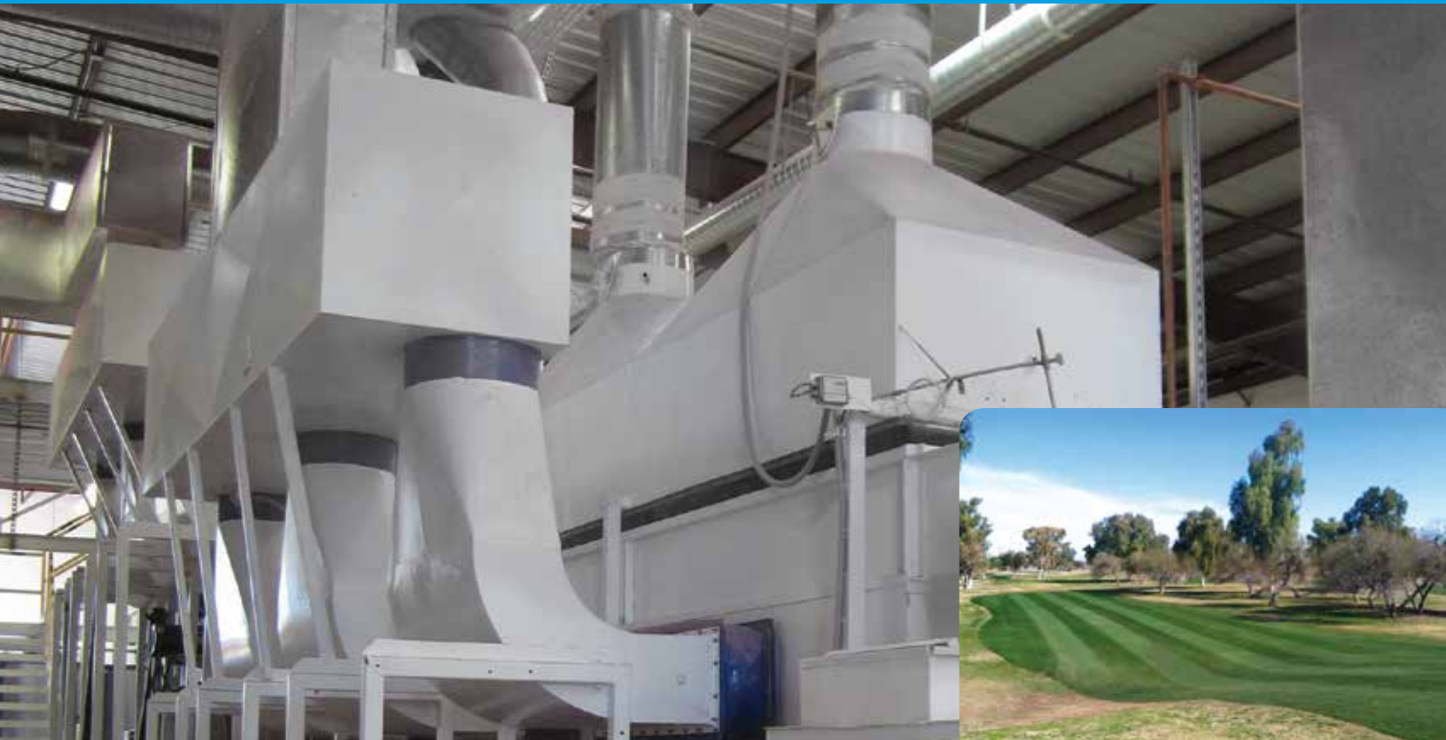
CYC Seed Company seed coating machine.