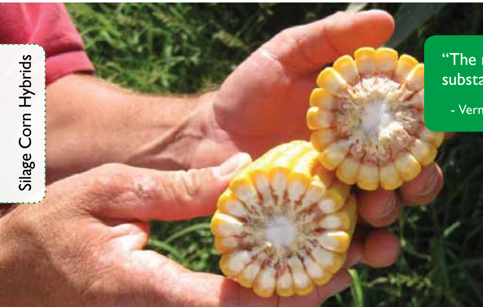
Silage Corn Hybrids

“The new hybrids can mean quite a substantial return on investment.”